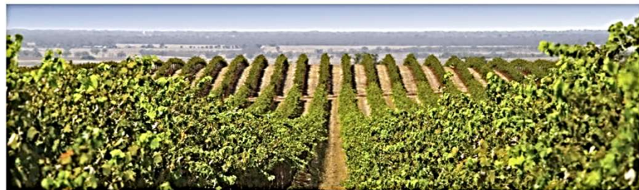
HEATHCOTE Alt 155M Climate Mild