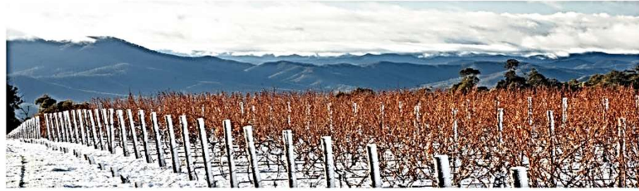
WHITLANDS Alt 800M Climate Cool