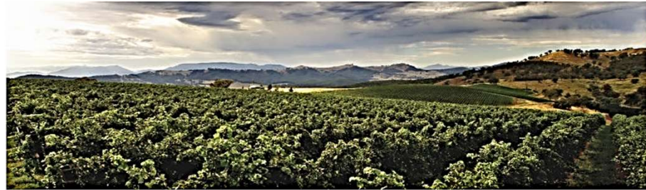
BANKSDALE Alt 485M Climate Cool