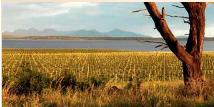
HAZARDS Tasmania 5 to 95m Climate: Cold East Coast