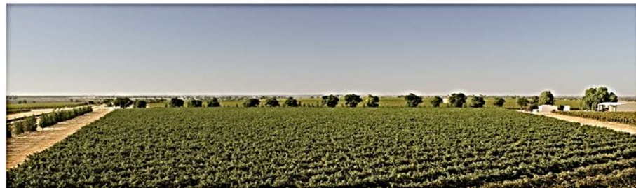
MYSTIC PARK Alt 71M Climate Warm