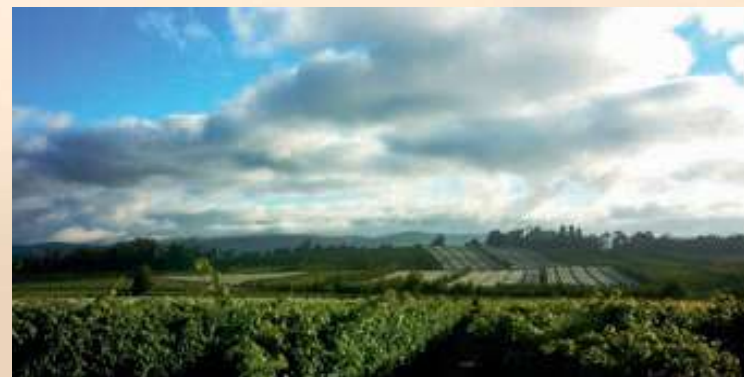
KAYENA Tasmania 10 to 30m Climate Cold Tamar Valley