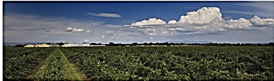
MILAWA Alt 155M Climate Mild